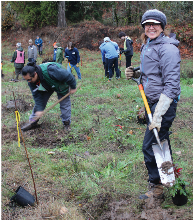
Over 80 volunteers were drawn from throughout the region to participate in the event.

Clackamas River Basin Council partnered with Clackamas County Water Environment Services and Friends of Trees to plant over 500 native trees, shrubs and ferns along Rock Creek in Clackamas County.