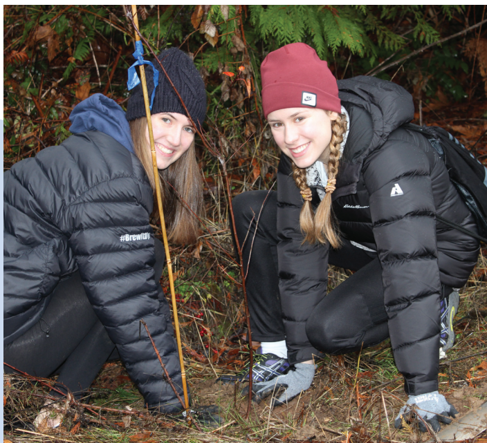
Students from Gladstone and LaSalle High Schools turned out to work on the restoration of Rock Creek, planting in rocky soil and moving yards of mulch with a bucket brigade!

The December 1st work party continued the project by planting upland areas of the site that have little tree cover and are exposed to summer heat and winter storm erosion. Among the species that were planted were red alder, big leaf maple, Douglas fir, Western serviceberry, snowberry, Oregon grape and sword fern. Planting natives will encourage the recovery of a more diverse habitat along this section of the creek and provide improved cover and food for wildlife.