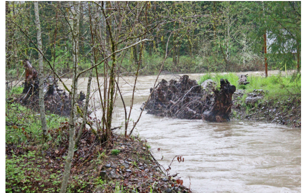
Fisher's Bend side channel entrance off of the Clackamas River.

Clackamas River Basin staff visited sites along the river during the event to evaluate the impact of restoration projects during high water. Up river at Milo McIver State Park, the boat ramps were under water and the river was running at 21,000 cubic feet per second below River Mill Dam.