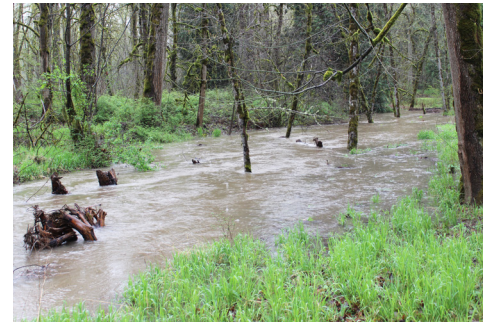
Flow rate drops dramatically as flood water enters the restored side channel.

It was rewarding to see the restoration project functioning as designed in high water.