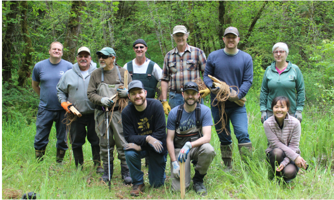
Volunteers prepare for in-stream xmas tree placement along Rock Creek near the confluence with the Clackamas River.

An ongoing partnership with Trout Unlimited, NW Steelheaders and ODFW resulted in two successful work parties this spring. Members and staff from the organizations were joined by volunteers from local neighborhoods to place Xmas trees at two locations in the Clackamas watershed. The trees are collected by Boy Scout troops after the holidays, and used to create in-stream habitat and cover for young fish.