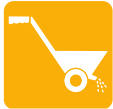
Fertilizers, pesticides, herbicides and poisons