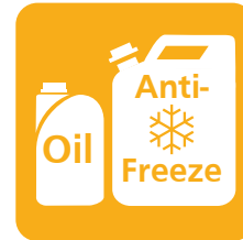
Fuels, automotive fluids and antifreeze