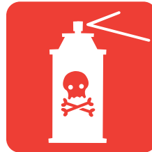
Aerosol spray products