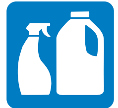
Household cleaners and disinfectants