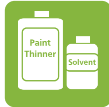
Solvents and thinners