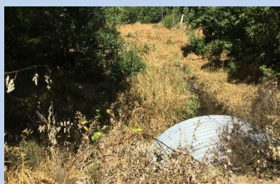
After 1st treatment - 8/2017