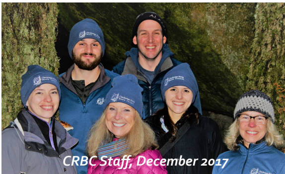
CRBC Staff, December 2017