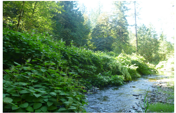
Japanese knotweed ( Fallopia japonica ) invading Deep Creek.

Did you know that invasive weeds cost Oregon residents millions of dollars each year? Did you know they impair water quality, contribute to erosion, and degrade natural areas important to fish and wildlife? The impact from invasive weeds is real. A recent study by the Oregon Department of Agriculture estimated a potential annual loss of $1.8 billion if weeds were left unchecked.* Yikes!