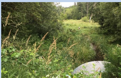
Before treatment - 7/2017

The Shade program is on track to surpass its 30 mile goal in 2018 through the addition of 57 acres across 4 new sites! Planting will occur along nearly 3.2 miles of Little Clear Creek, making it the largest project in the program. One of the 2018 sites, a Port Blakely property (pictured below), was prepped for planting in 2017. In addition to planting taking place on the new sites, previously planted sites will receive maintenance and survival monitoring in 2018.