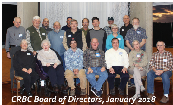
CRBC Board of Directors, January 2018

Visit clackamasriver.org/donate/ for more details.