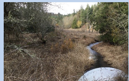
After 2nd treatment - 11/2017

Shade participants and graduates will be invited to a series of FREE workshops this summer! Folks can look forward to classes on gardening for wildlife, raingarden construction, and weed management. Field trips to some of our stellar Shade Our Streams participant properties are included! The first class - Naturescaping - will be held on April 14th! Enroll by emailing Suzi Cloutier, suzi@clackamasriver.org , or calling 503-303-4372 x 105.