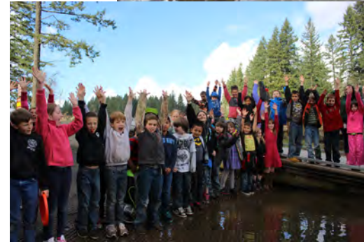
River Mill Elementary students raised over 400 Rainbow Trout and released them into Estacada Lake as part of the Fish Eggs to Fry Program thanks to ODFW, CRBC, and NW Steelheaders.