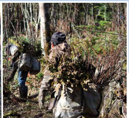
Western red cedar seedling.