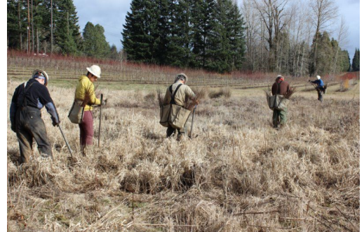
Volunteers and staff with the Shade Our Streams project remove invasives and plant native vegetation along the Clackamas River.